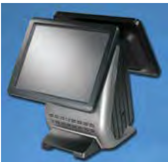
Optional Integrated 15" LCD Customer Display