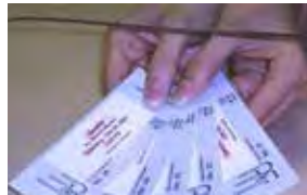
Theater Concessions / Ticket Booths / Box Offices