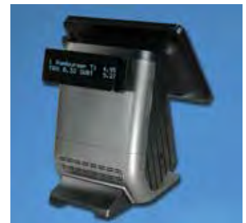
Optional Integrated VFD Customer Display