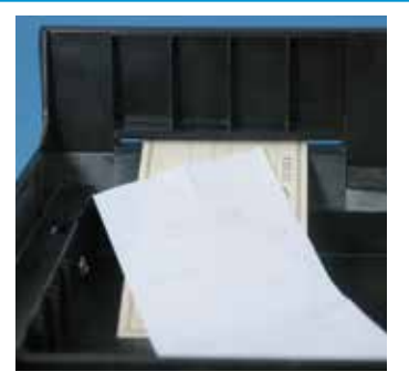
Checks And Card Slips Can be Inserted into the Media Slots Without Opening the Drawer